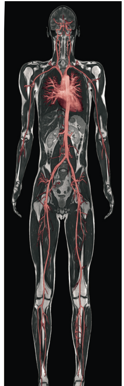
MRI whole Body

Tel. 0211/ 22 97 32 02 info@radprax-vorsorge.de info@radprax-germany.com